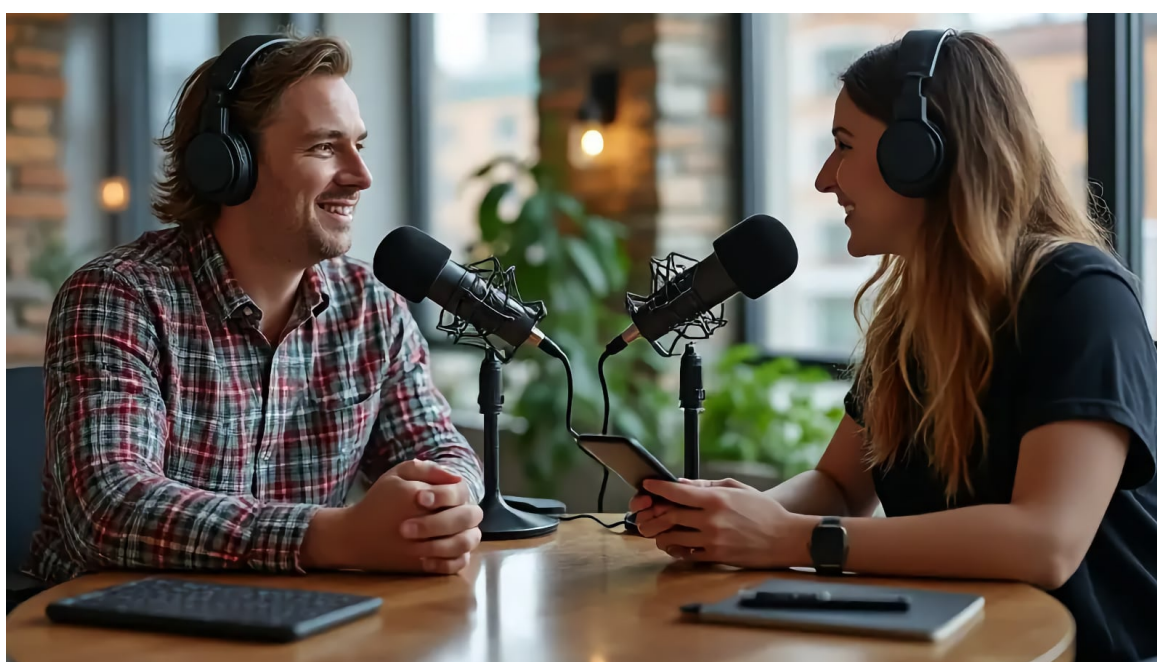
Two people wearing headphones smiling at each other across a table with podcast microphones

Read this article online: https://www.hedy.ai/post/audio-and-video-transcription-complete-guide/