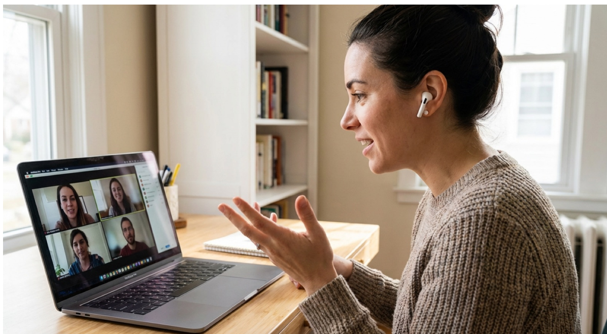
Woman wearing earbuds gesturing during a video call with four participants on her laptop at home

Read this article online: https://www.hedy.ai/post/december-2025-updates/