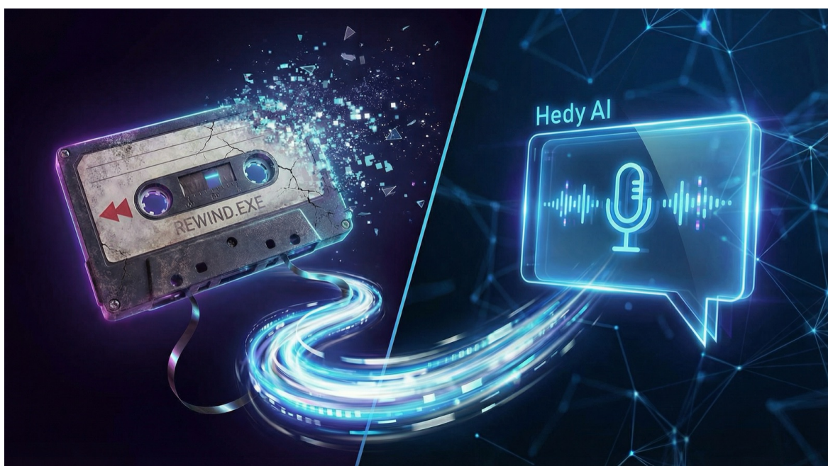
Split illustration of a crumbling cassette tape labeled Rewind transforming into the Hedy AI microphone icon

Read this article online: https://www.hedy.ai/post/export-limitless-data-to-hedy/