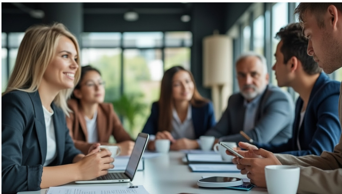
Smiling woman leading a meeting with five colleagues around a conference table with laptops

Read this article online: https://www.hedy.ai/post/hedy-2-10-smarter-context-flexible-transcription/