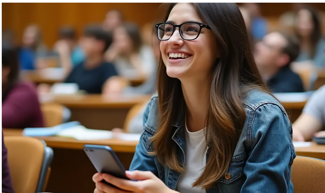
Smiling woman with glasses holding a smartphone in a lecture hall audience

Read this article online: https://www.hedy.ai/post/hedy-ai-automatic-suggestions/