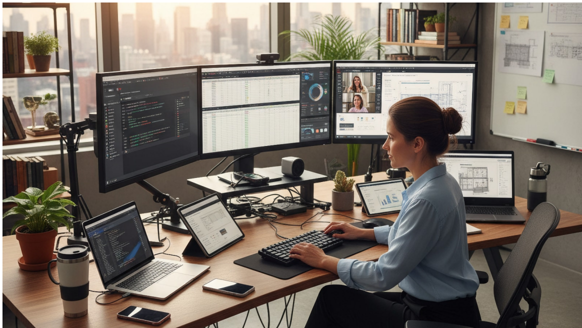
Woman working at a multi-monitor desk setup with dashboards and a video call

Read this article online: https://www.hedy.ai/post/hedy-meeting-assistant-activepieces-integration-automation/