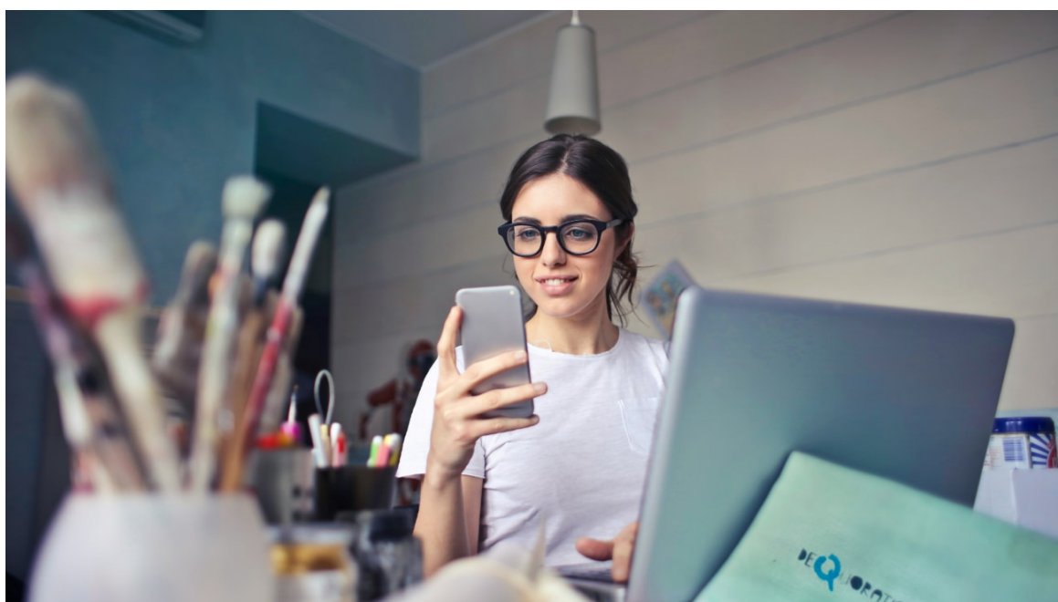
Woman wearing glasses checking her phone while sitting at a desk with a laptop

Read this article online: https://www.hedy.ai/post/session-recap-emails-meeting-insights/